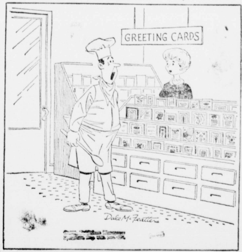
"I need about 78 'get-well' cards!"