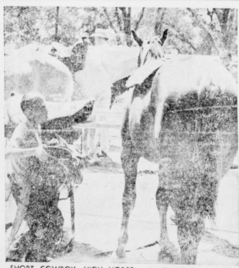
SHORT COWBOY, HIGH HORSE — At Cal Farley's Boys Ranch, a point of tourist interest at Old Tascosa, 36 miles northwest of Amarillo, each youngster must learn to saddle his own horse.