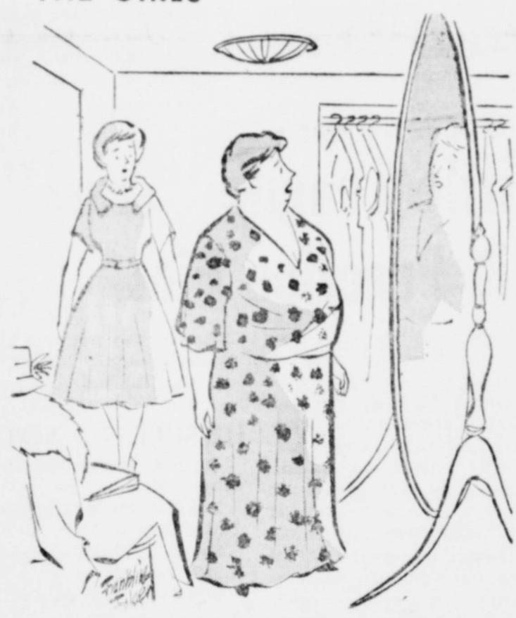
"My trouble is I always look as if somebody's in the dress with me."