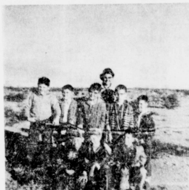
A big bunch of sports and a Den Mother