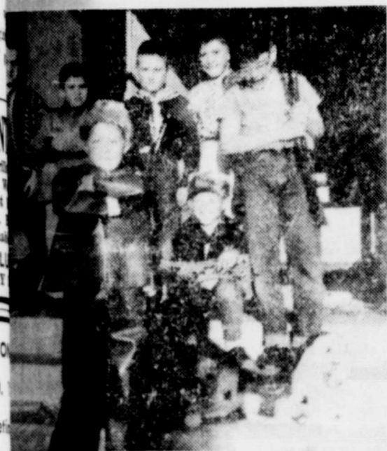
Well, we can't all be Chiefs . . .

The Rankin (Tex.) News— Thursday, February 4, 1965