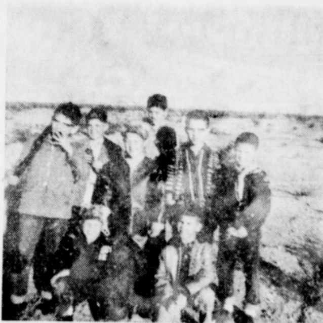
A big bunch of sports