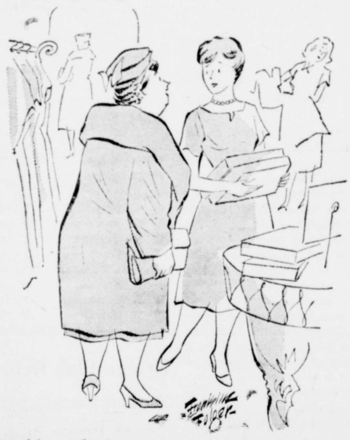
"I want to see the dresses in your ad that hug your every curve, turning your figure into a thrilling, slender silhouette."