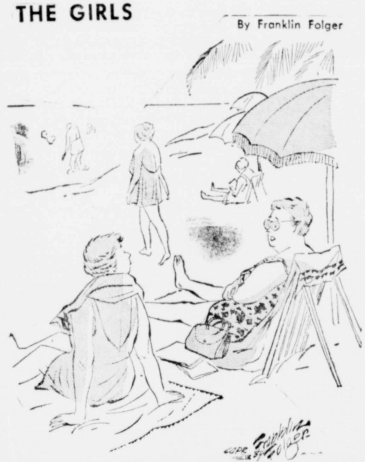
"I could really enjoy all this if I knew the Russians weren't trying to conquer me!"