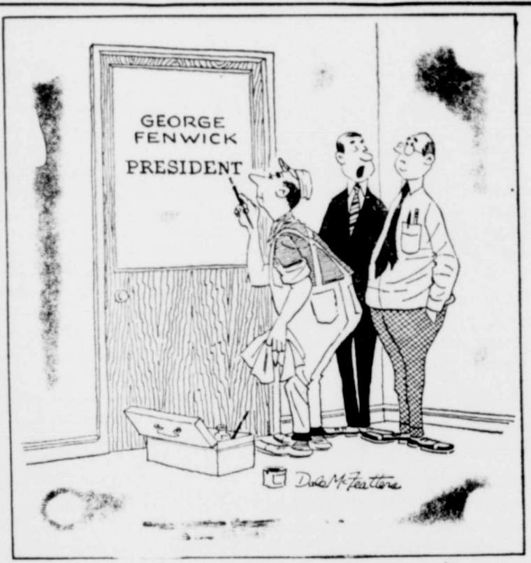
"Remember how for years our favorite expression was 'Let George do it!' "