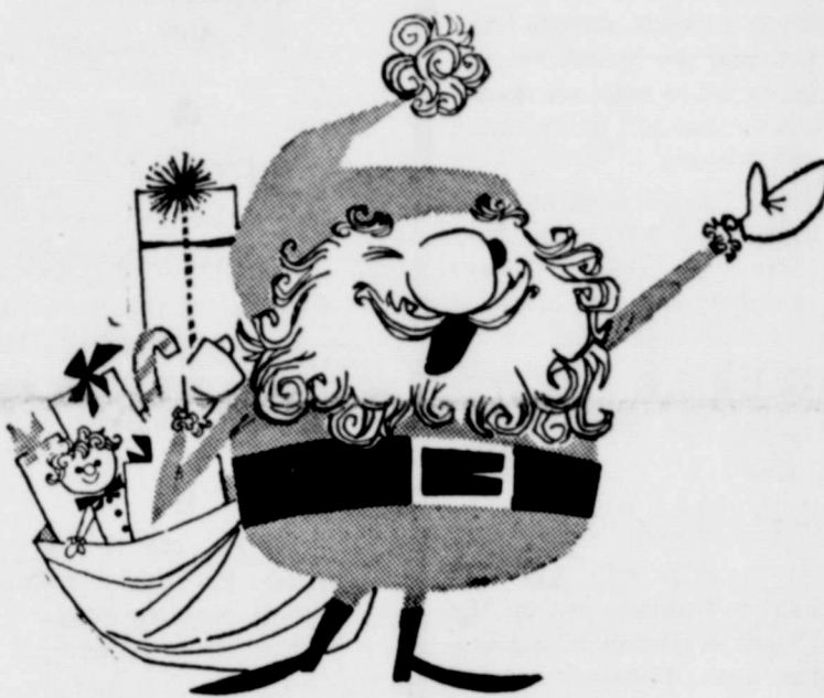
See You Saturday with a Ho!, Ho!, Ho!