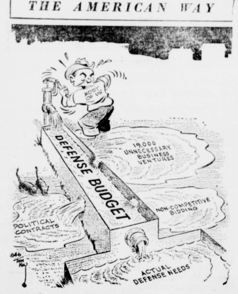
The Leaky Trough