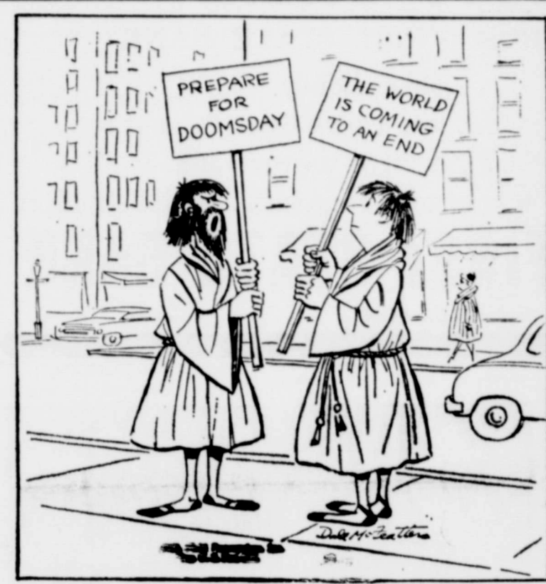
"What's this I hear about you arranging a 20-year mortgage on your house, Montmorency?"

And, after all, Iraan has nothing much to lose. They haven't won a game in over 4 years and the law of averages says they are bound to win one sometime.