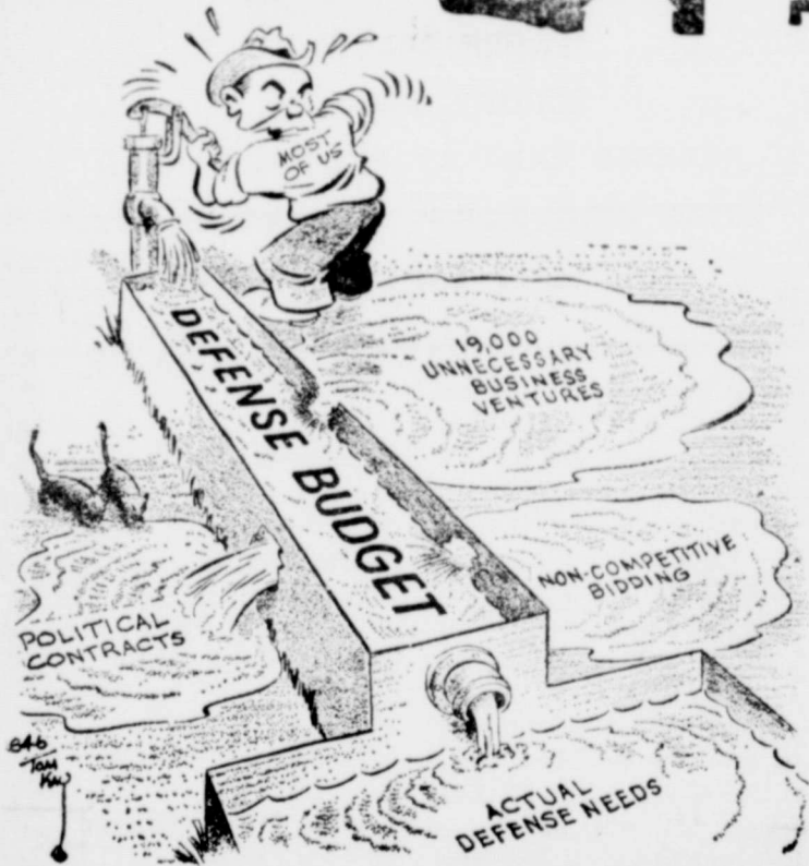
The Leaky Trough