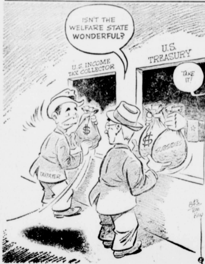
... not for the taxpayer