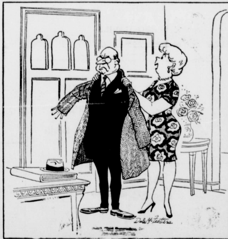
"You'll feel better, Dear, after you've chewed out a few employees!"