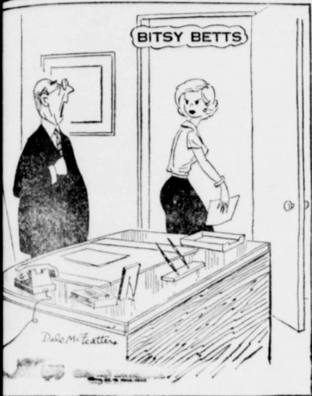
Do not have a Napoleonic complex, Josephine — er, Miss Betts!"