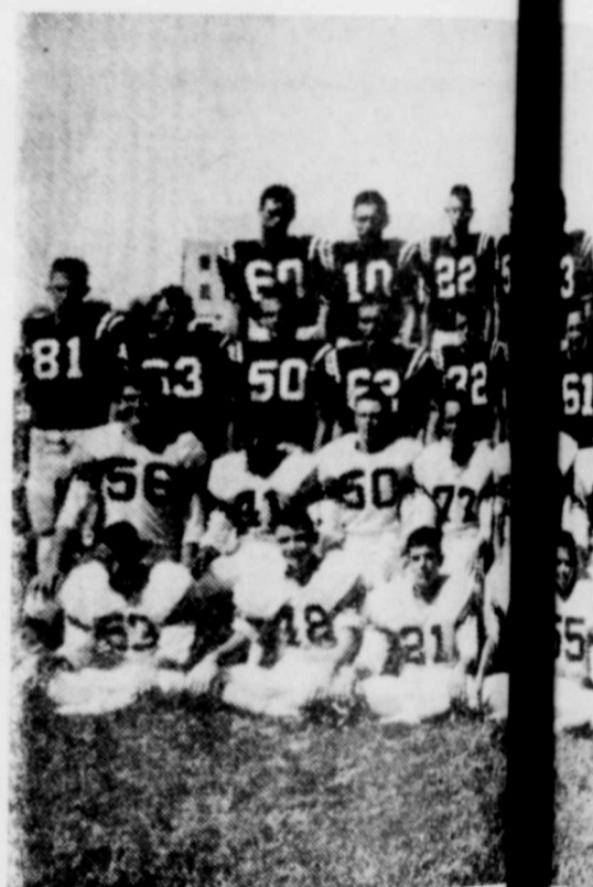
FOR HOMECOMING, 1963—We the entire Rankin Red Devil Squad and their coaching staff is a proud and honored tradit