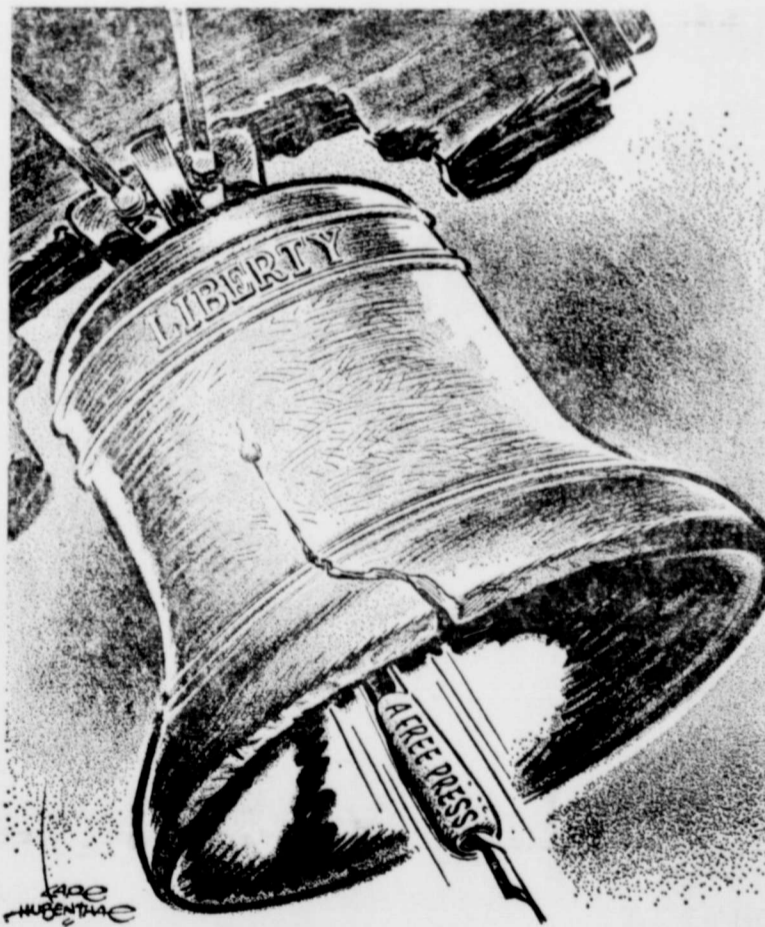
NATIONAL NEWSPAPER WEEK, OCT. 13-19