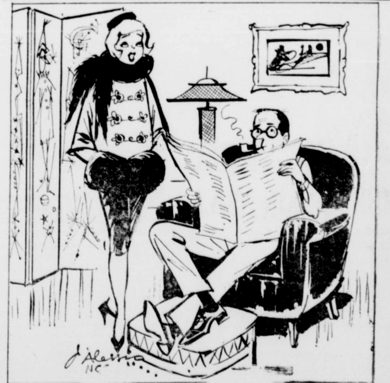
"I'm going shopping, dear. I simply have got to do SOMETHING to take my mind off our money troubles!"