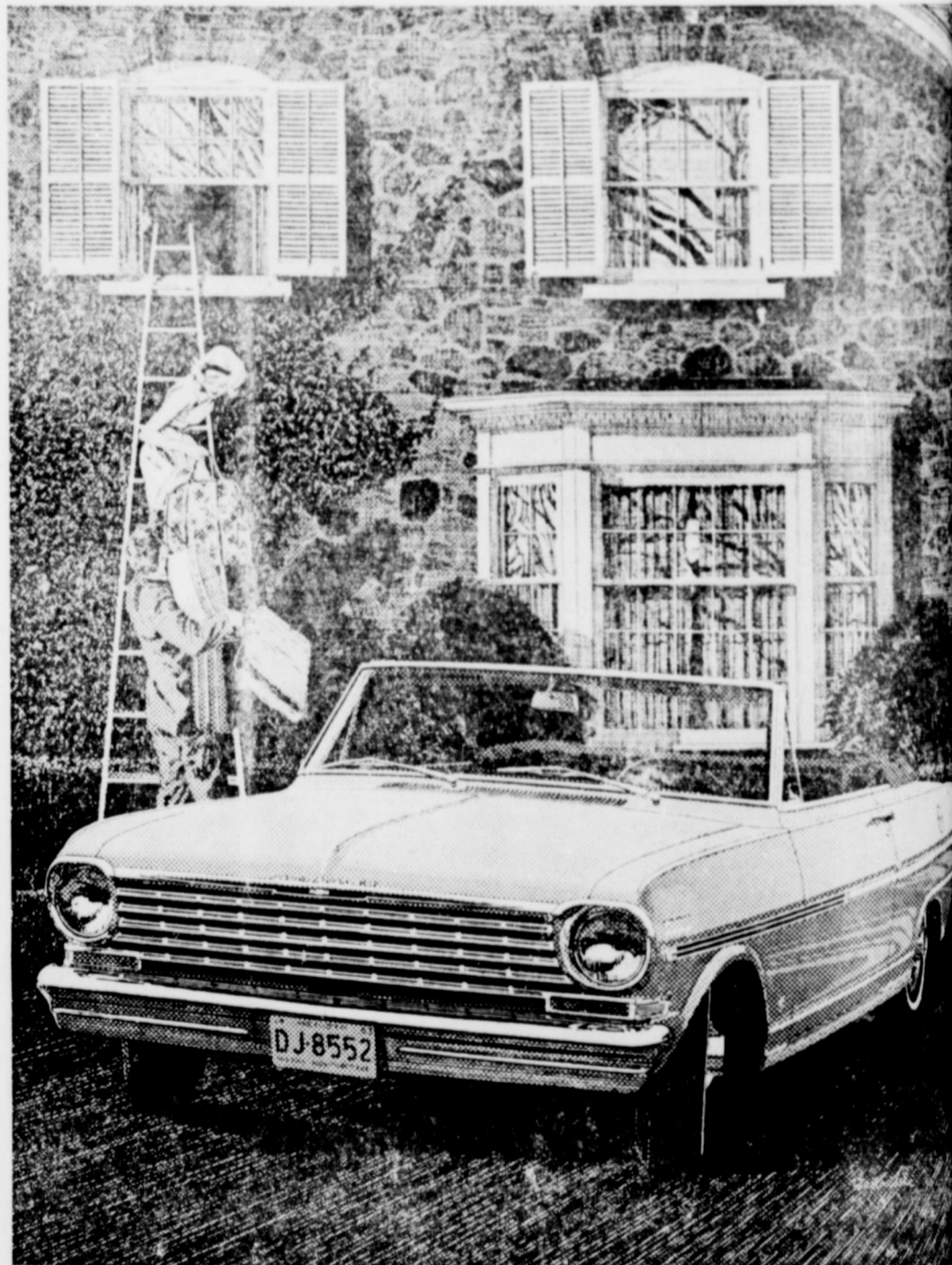
Chevy II Nova 400 SS Convertible above. Also available as SS Coupe. Super Sport equipment optional at extra cost. Also a choice of 10 regular Chevy II models.

All this plus Chevy II standard features: flush-and-dry ventilating system that helps remove rust-causing elements from rocker panels; battery-easing Delco-Rom generator; convenient self-adjusting brakes; longer lasting exhaust system; styling fresh as morning coffee, poured into a rugged Body by Fisher—and more. You'll find two can live as cheaply as one—when they're living it up in a new Chevy II! *Optional at extra cost.