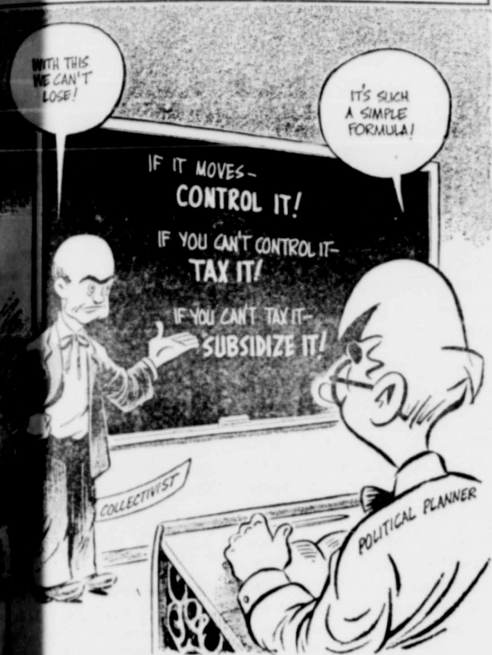
Formula for Socialism