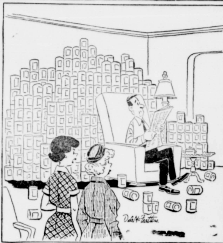
"He got an extra dividend on his International Can stock!"