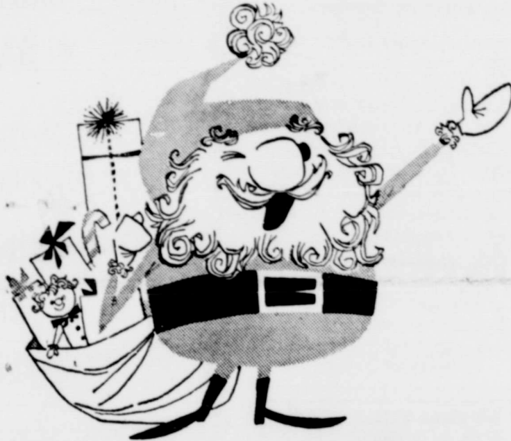
And a Ho, Ho, Ho to You, too!

County offices are to be clos- ed from December 22 until Dec- ember 26.