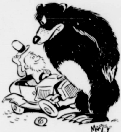
RELAX STRANGER, CAUSE WE IS BOTH PERPECTED BY