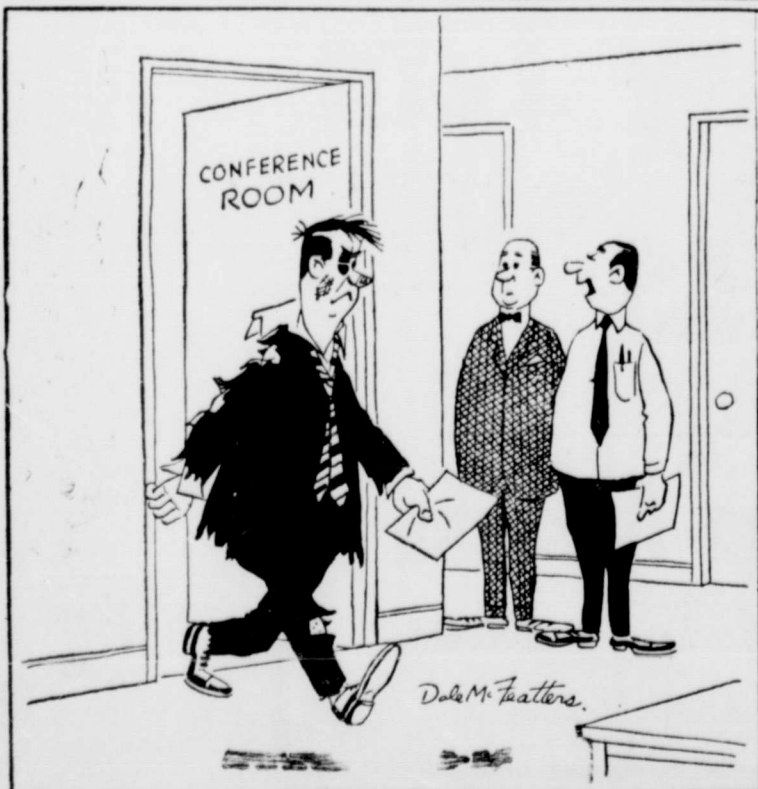
"One thing about Argyle — he's no 'organization man'!"