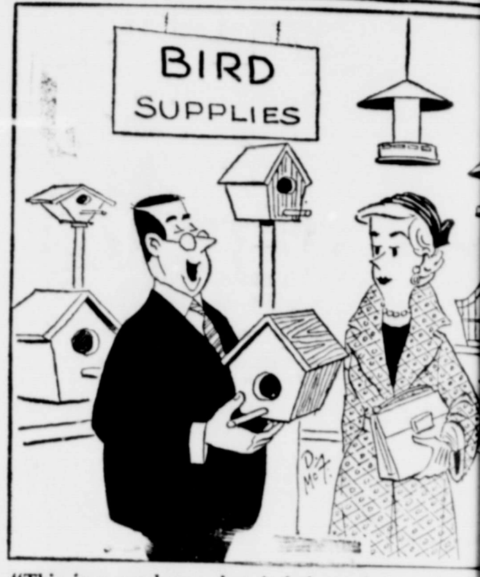
"This is a used one, but it belonged to a family elderly finches who wintered in Florida!"