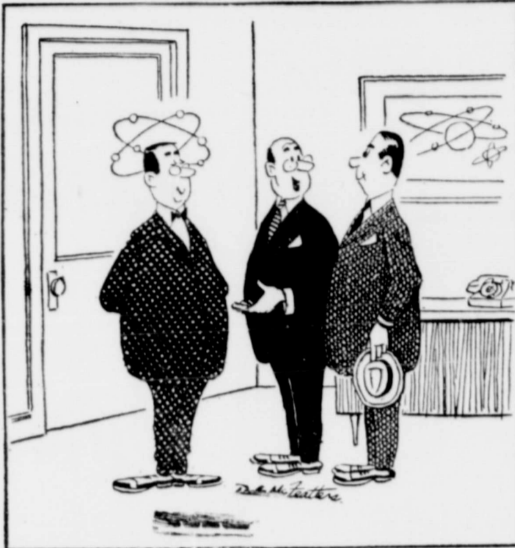
"I'd like you to meet Dr. Argon, our top atomic scientist!"