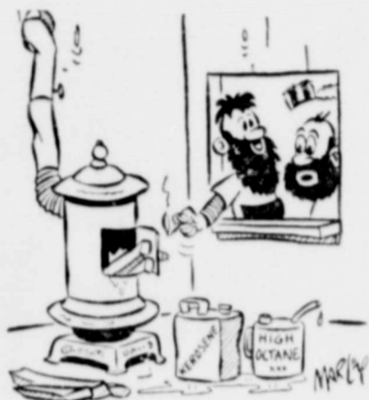
IT'S OK NEIGHBOR, WE GOT A FIRE POLICY ON OUR NEW STOVE WITH

ELDORADO lays it on Sander- son and will be out to try and outdo what the Big Lake Owls and the Red Devils did to the Eagles as they build up courage for their game November 16 with Big Lake.