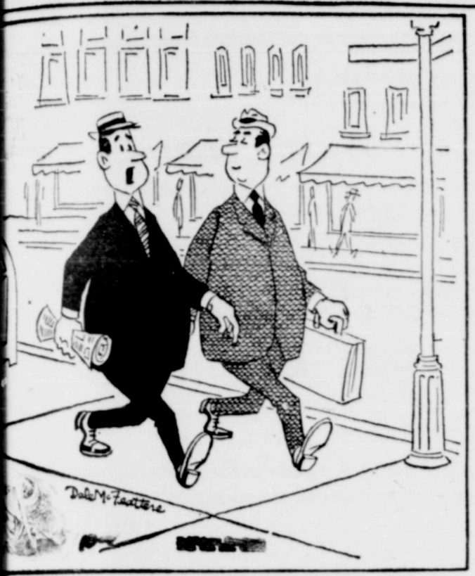
yes, I have a steady income — but my wife has a steadier outgo!"