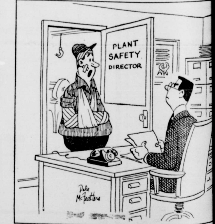
"I was reading the 'Watch Your Step' sign!"