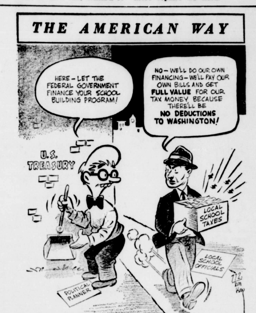
To "Give" One Group Anything, Government

It's never too late to mend because, the older we become, the more repairs we need.