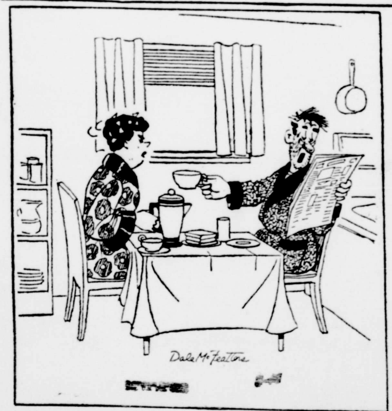
"The sales banquet last night was a very dull affair more champagne, Bubbles!"