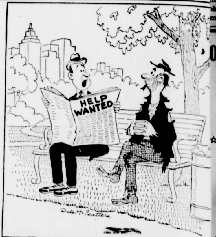
"To make a long story short, I told my boss one of us would have to go!"