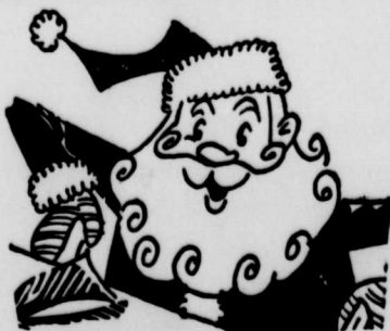
Santa Says: Christmas is not a date. It's a state of mind.

Sam's Chicken House located at 1717 W. Beauregard in San An- gelo is the place to go for the finest in prepared foods. Their kitchen is clean and their dining rooms present an atmosphere you will enjoy. The management of this modern restaurant has done everythong in his power to provide a place to which you will want to return. The comfortable and attractive decor of the dining rooms, plus prompt and courteous service has made this restaurant one of the most popular in town. Sam's Chicken House special- izes in fried chicken, Swift's Premium steaks and Mexican foods. Their hours are 6 a.m. to 2 a.m. daily. American Express credit cards honored. In this Review we want to com- pliment the management on their fine food and friendly courteous service.