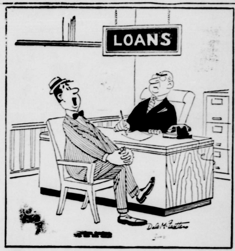
"My current bills aren't the problem-it's the tenyear-old ones!"