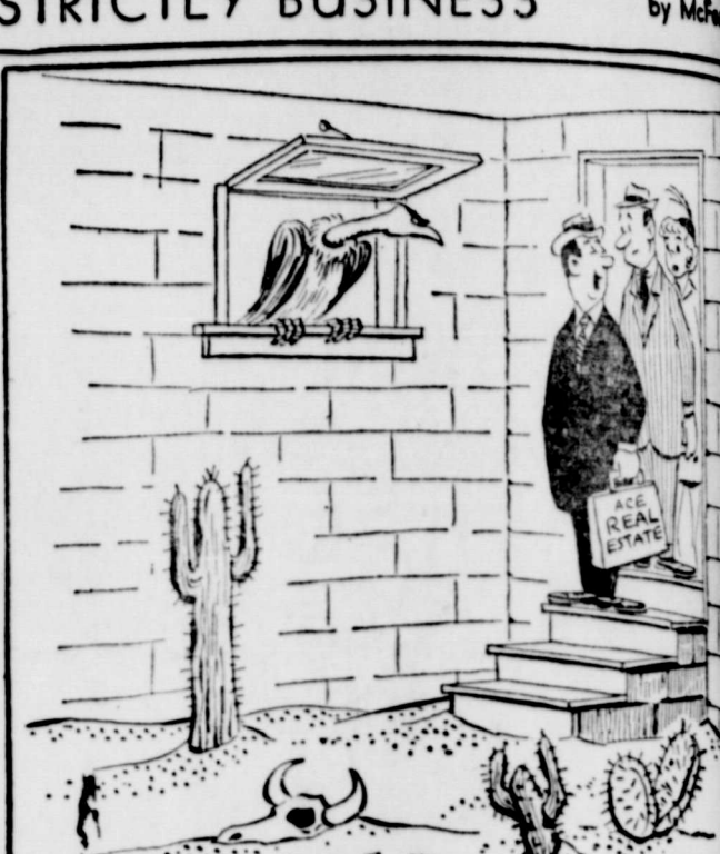
"Talk about dry cellars!"