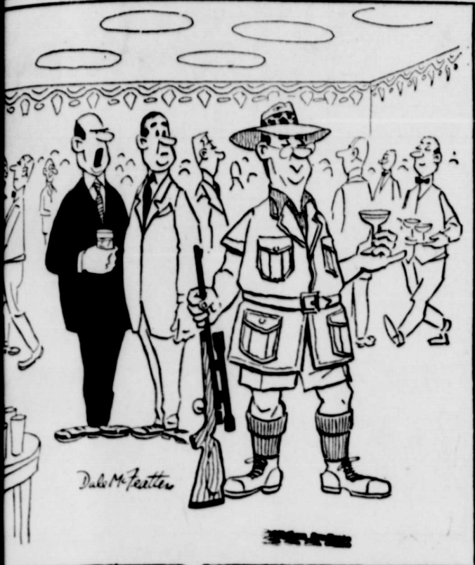
For Heaven's sake, don't ask him where he spent his vacation!