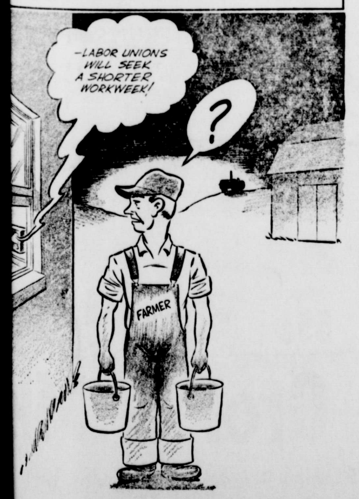
Dawn - to - Dusk