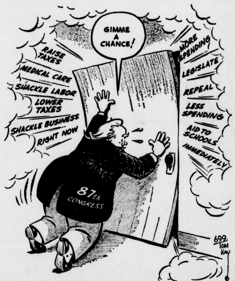
Campaign Promises Catch Up!

AT THE RANKIN NEWS YOU WILL FIND ALL THE OFFICE & BOOKKEEPING SUPPLIES YOU WILL NEED FOR THE NEW BUSINESS YEAR (We Deliver—Just Call)