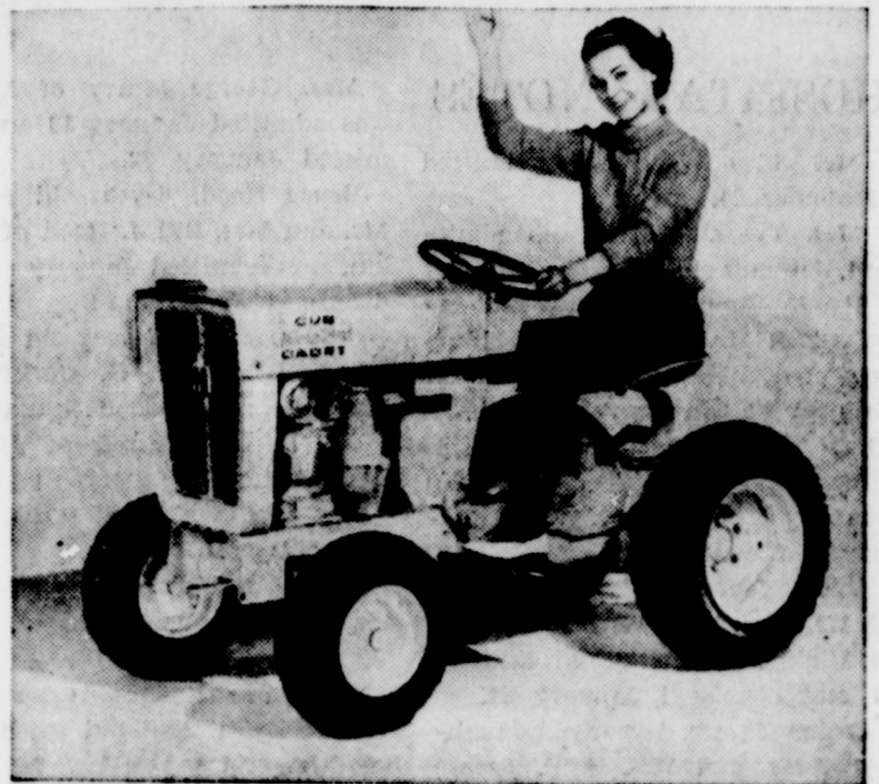
Suburban living fast is becoming a pleasant way of life as new machines are put in the market to simplify outdoor household chores through mechanization. More of such conveniences are in prospect, too. Latest entry is this International Cub Cadet, a compact lawn and garden tractor.