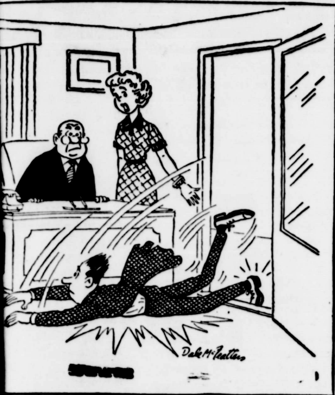
"Meet the new Safety Director!"