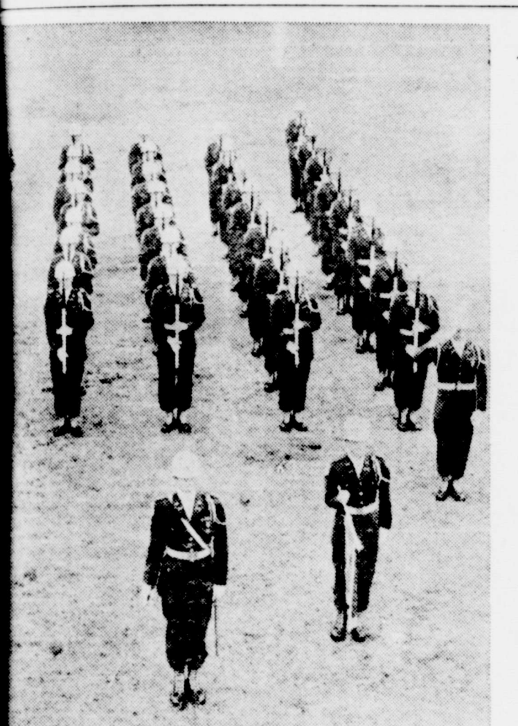
The Wainwright Rifles