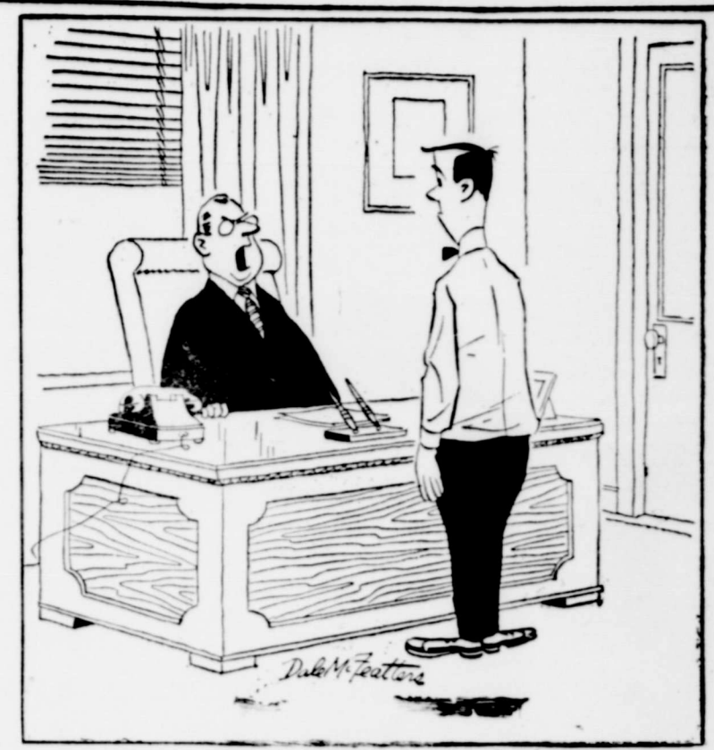
"Your raise, Argyle, will become effective as soon as you do!"