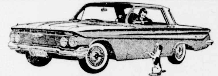
New '61 Chevrolet IMPALA SPORT SEDAN

Just drop in and take a drive in one of the 30 spanking new '61 models your Chevy dealer now offers under the same roof. With every drive, your dealer is giving away free Dinah Shore Christmas records while they last. So hurry! And you'll find that here's the easy, one-stop way to shop for the car you want. There's a model to suit almost any taste or need—at a price to suit almost any budget. There's a whole crew of new Chevy Corvairs, including four family-lovin' wagons. New Biscaynes—the lowest priced full-size Chevrolets. Popular Bel Airs. Sumptuous Impalas. And America's only true sports car—the Corvette. Come on in and pick your new car the easy way—on a one-stop shopping tour!