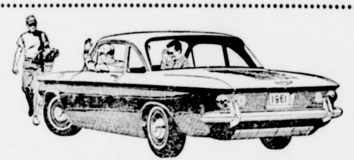
New lower priced '61 CORVAIR 500 CLUB COUPE

These beautiful Bel Airs, priced just above the thriftiest full-size Chevies, bring you newness you can use. Roomier dimensions reach right back to the easier loading trunk that lets you pile baggage 15% higher.