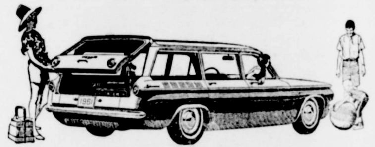
New '61 Corvair 700 LAKEWOOD STATION WAGON

See what Corvair's got in store for you in '61! Thriftier sedans and coupes with nearly 12% more room up front for luggage. That rear engine's spunkier, too, with a gas-saving new axle ratio to go with it.