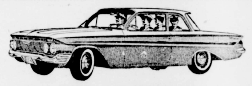
New '61 Chevrolet 2-DOOR BEL AIR SEDAN

You'll see fire models in the '61 Impala series—the most elegant Chevies of all. They're sensationally sensible from their more parkable out size to their remarkably roomy in size. And note that trim new roof line.