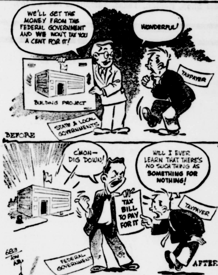
The Taxpayer - Only Source of Government Money