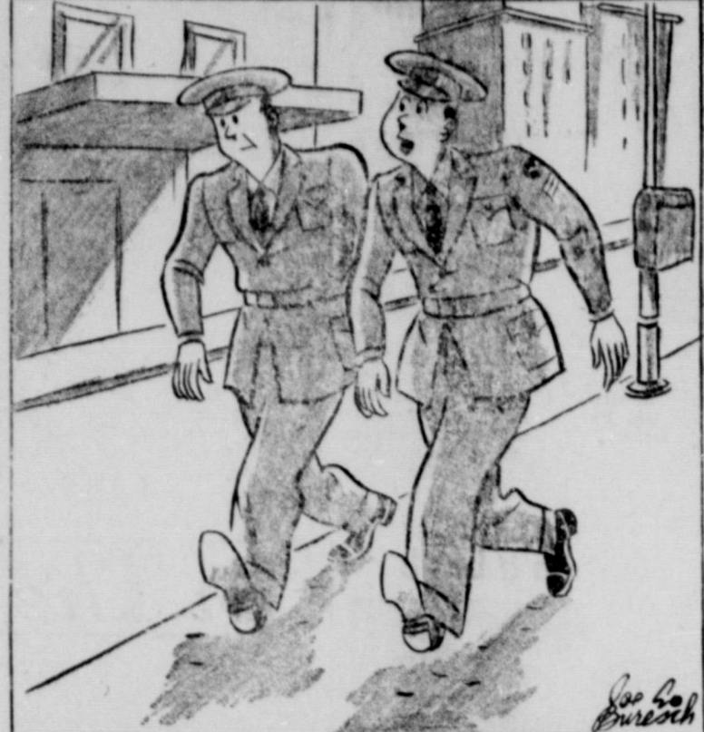
"I'm worried about the post-war rehabilitation of radio news analysts."