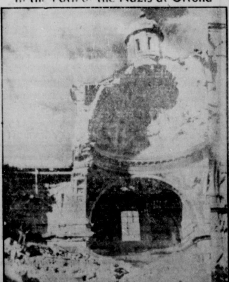
This shows a job done by the fleeing Germans on the 1100-yearold St. Thomas Cathedral in Ortona, Italy, after the Canad entered the town. Destruction of the church was one of the en my's last acts, an attempt to impede the advancing Allies.