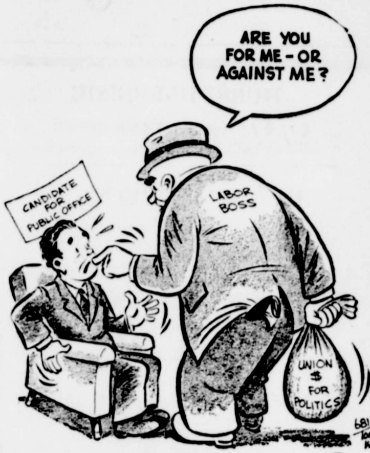
On The Spot

NEWEST most beautiful PORTABLES ever dreamed of!