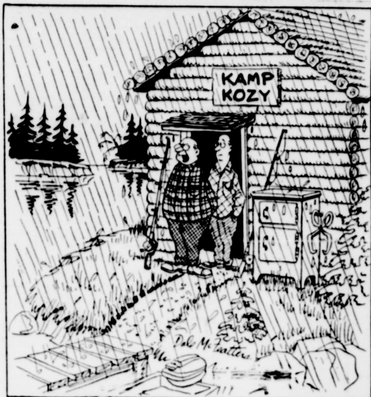
"I'll bet my office force is enjoying my vacation more than I am!"