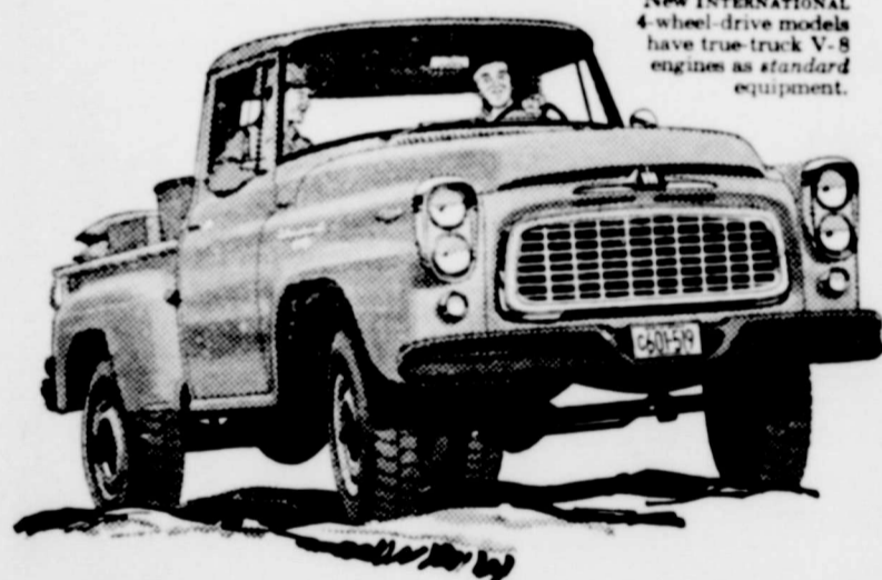
New INTERNATIONAL 4-wheel-drive models have true-truck V-8 engines as standard equipment.