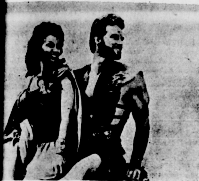
HIS vow fulfilled, his father's murder avenged, and barbarians defeated, the Goliath and Londo ride away with her villagers to start a new life together.

and the Barbarians" at the Ford Theatre Sunday and Tuesday, April 17, 18, and 19.