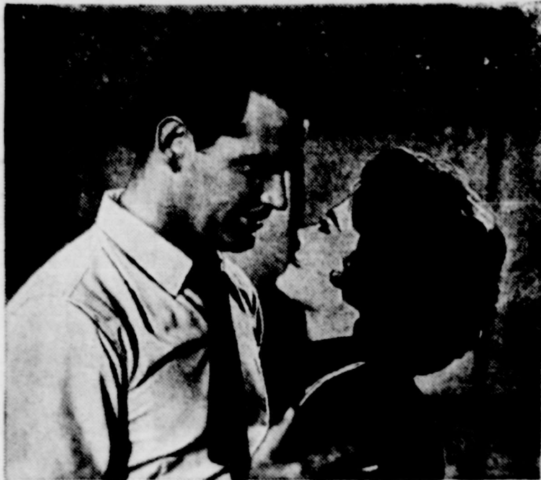
JAMES GARNER AND NATALIE WOOD give gay performances in "Cash McCall" showing at the Ford Theatre Sunday, Monday and Tuesday, April 3, 4, and 5. Garner is the "ever lovin' Zillionaire" and Miss Wood is the girl who keeps giving him the air.