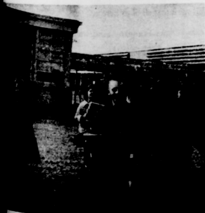
SCHOOL IS OUT FOR THE CHRISTMAS HOLIDAYS!