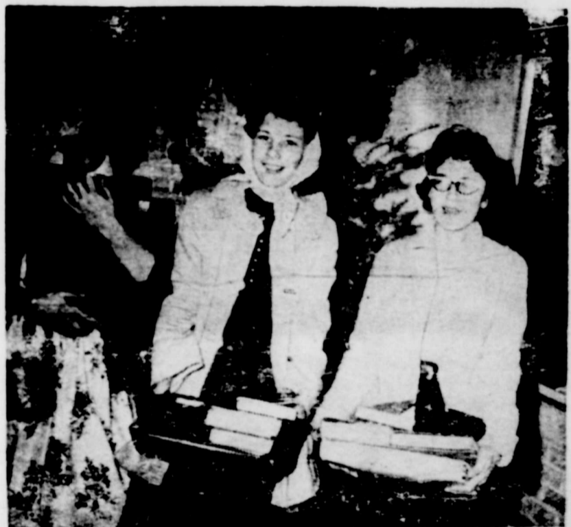
NOT TO BE LEFT OUT, three high school girls stop by the Christmas tree prior to getting in studies on a large load of books.