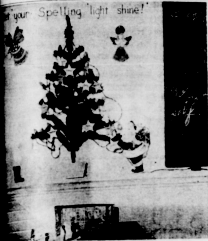
CHRISTMAS TREE with a message is featured in First Grade decorations in Mrs. Tippett's room as it lights up the "Spelling Tree".