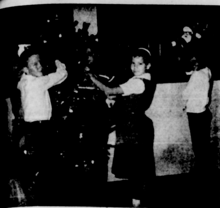
CHRISTMAS DECORATIONS go up at the Rankin Junior School. Students take a little time from their studies to "deck the halls" as the tree and the trimmings are placed in the lobby of the building.

(Tex. Decem Claus tmas er wan is Ga am i in M our Ch 'clock lor