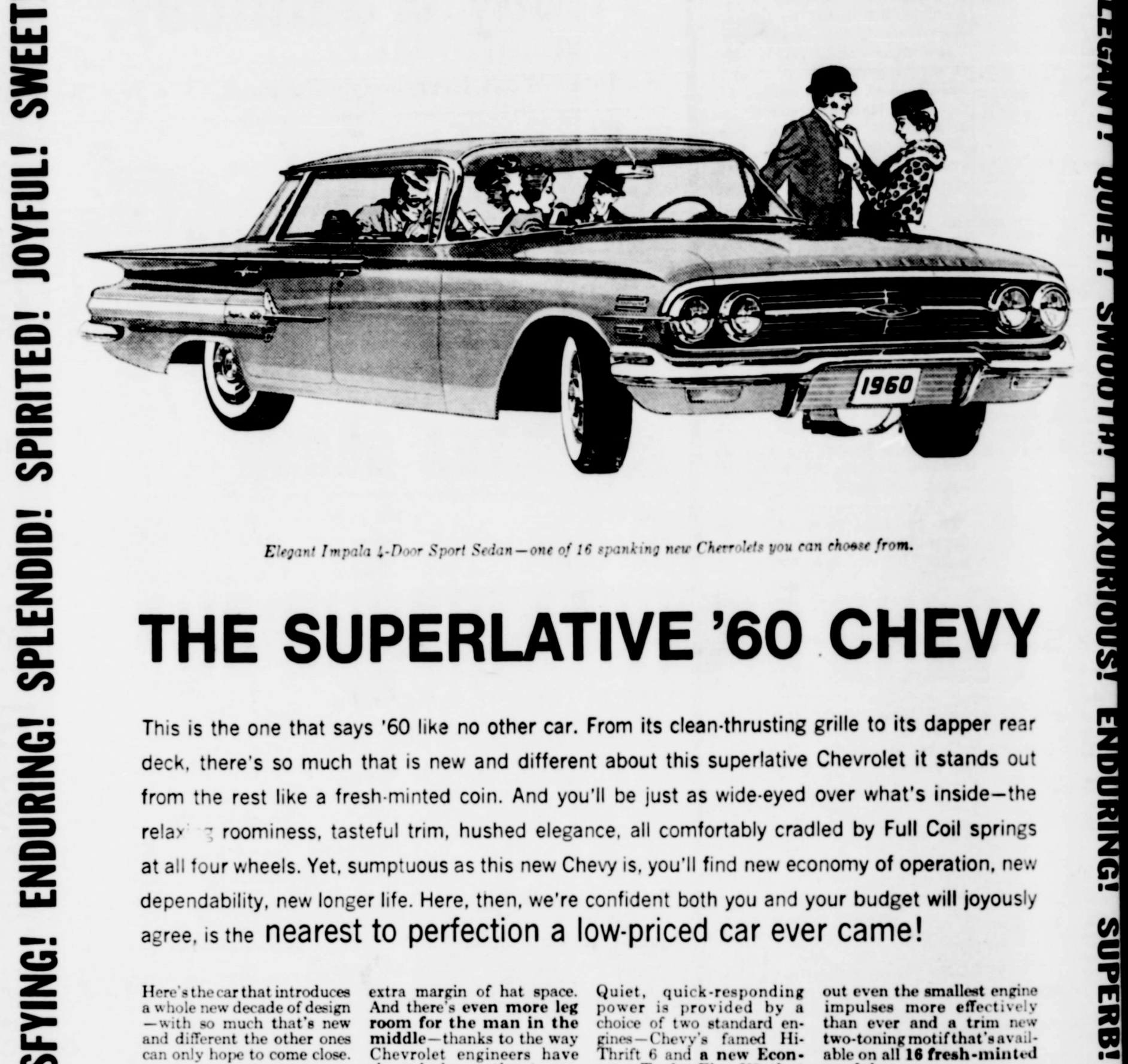
Elegant Impala 4-Door Sport Sedan - one of 16 spanking new Chevrolets you can choose from.