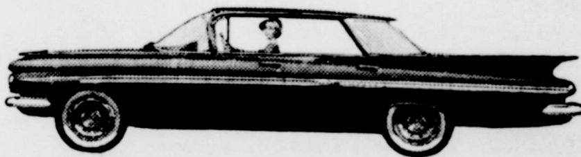
Now there's an Impala Sport Sedan . . . one of Chevy's full series of Impalas for '59

BEST ECONOMY . . . SOCK AWAY YOUR CHEVY SAVINGS As sure as two Chevy Sixes won their class in this year's Mobilgas Economy Run, getting the best mileage of any full-size car!