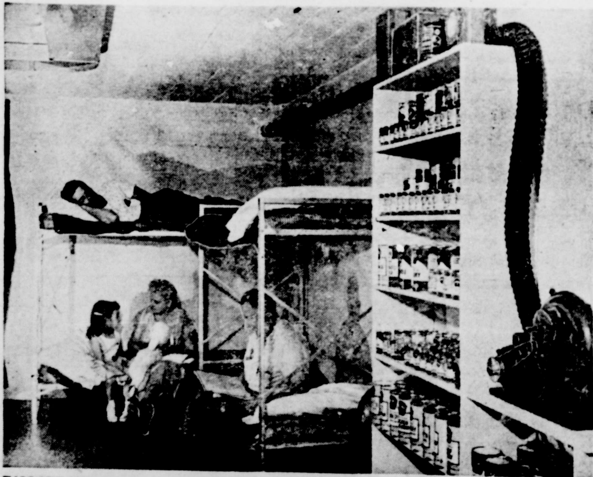
FALLOUT SHELTERS are the best way for rural Americans to protect themselves from a massive nuclear attack which could unleash dangerous radioactive fallout throughout the country. Some of the shelters recommended by the Office of Civil and Defense Mobilization are not as elaborate as this one, which includes an auxiliary generator and an electric air filtering and ven-

tilating system. However, all recommended shelters should include the basic features shown here—a place to sleep; food, water and medical supplies, and at least eight inches of concrete or an equal weight of other materials for shielding the shelter against fallout. Free designs may be obtained by writing to OCDM Rural Civil Defense, Battle Creek, Mich.