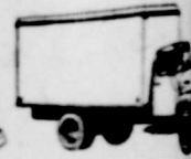
New compact-duty models. Short length for easier handling in tight spots. Bigger bodies.