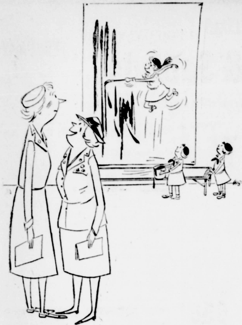
"It's a new art form—all you need is paint and a trampoline."