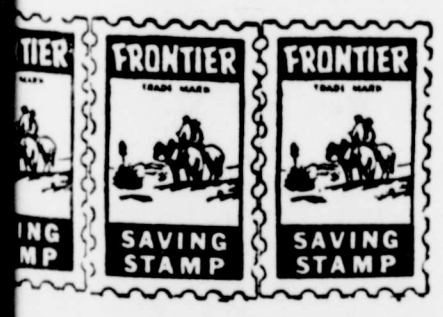
Five Frontier Trading Stamps

Diamond 12 oz. Glass Sweet MIDGET PICKLES 39c