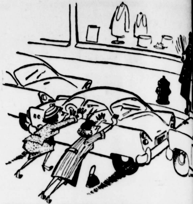
A study of 12,000 driver license tests shows women are good as men, except for one thing.