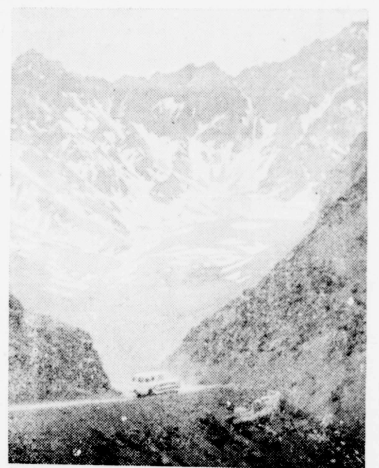
Precision roadability was vital on this wild trail!

Air Conditioning—temperatures made to order—for all-weather comfort. Get a demonstration!