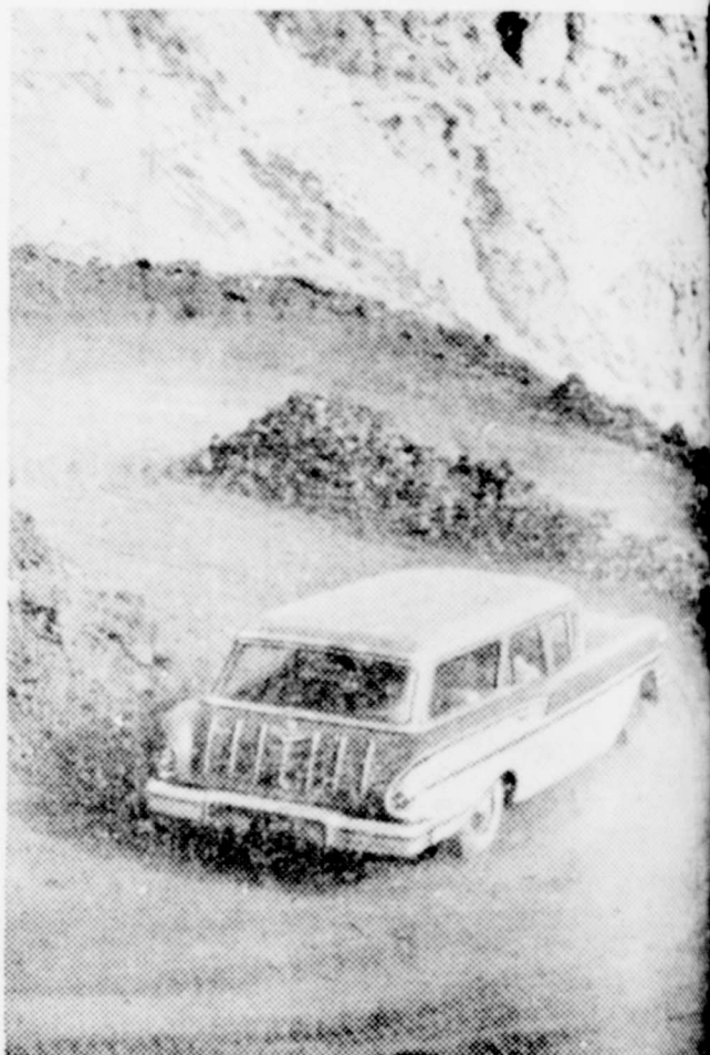
Grade Retarder gave extra braking on corkscrew descents

Atlantic to Pacific and back, across the towering Andes, in 41 hours.