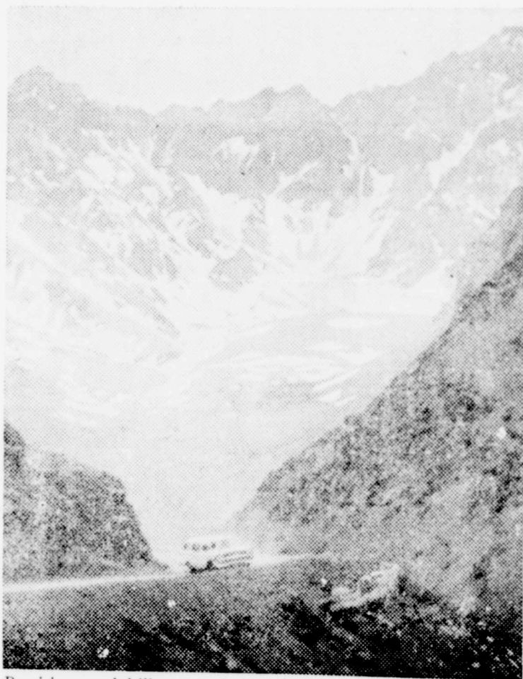
Precision roadability was vital on this wild trail!

Air Conditioning—temperatures made to order—for all-weather comfort. Get a demonstration!