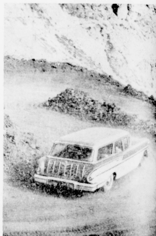
Grade Retarder gave extra braking on corkscrew descents.