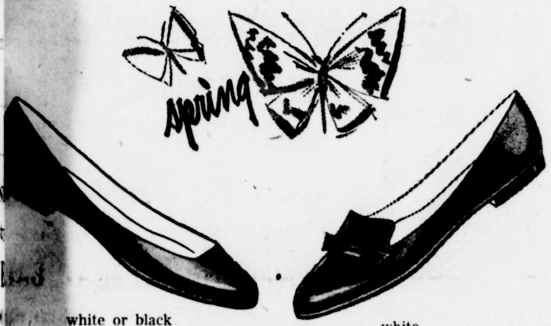
white or black calf white black grey