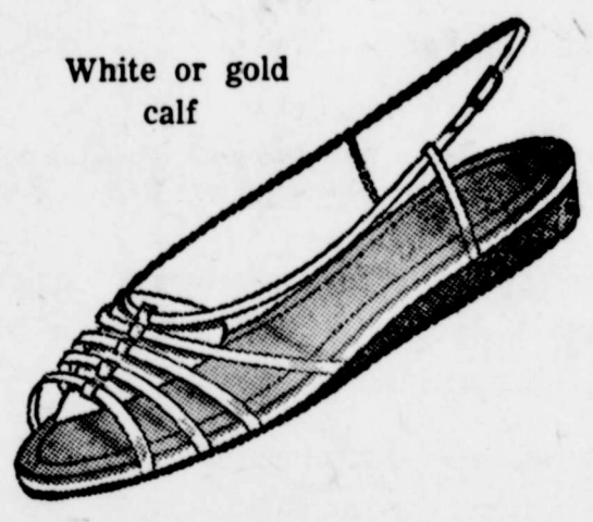
White or gold calf

. . . be smart! shop our wide selection of shoes for the family . . . . .