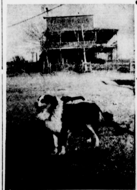
AN OLD TIMER ... formerly of Upland

The picture showed an old hotel that was moved to Rankin from Upland. According to Mrs. Zack Monroe, it took three months to move the building which was later destroyed by fire.