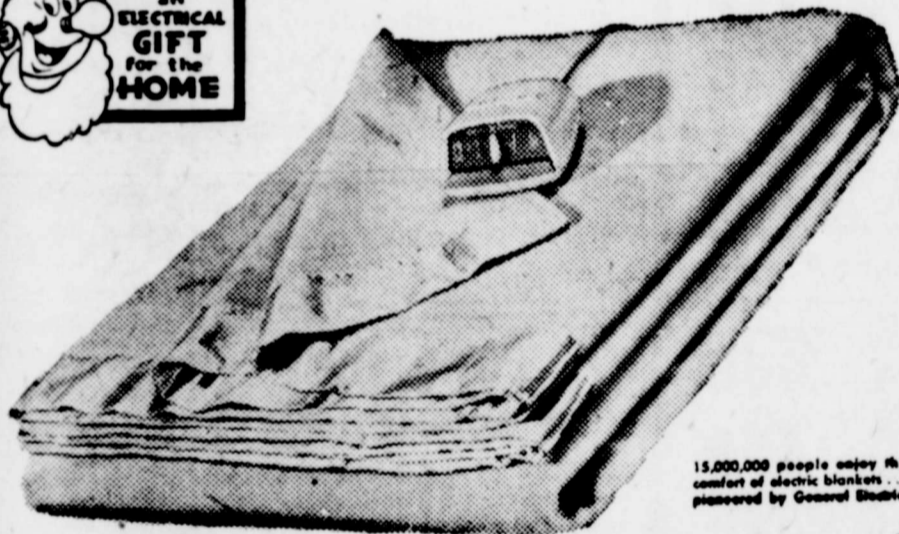
15,000,000 people enjoy the comfort of electric blankets... pioneered by General Electric.