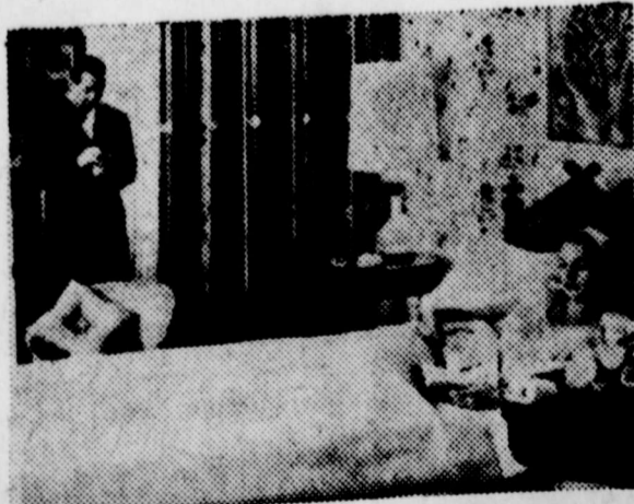
"Happy Marriage" Blankets—Dual Comfort-Selector, lets each sleeper choose a different degree of warmth.

Wonderful light and refreshingly styled, the new General Electric Blanket affords trouble-free hours of relaxing sleep in personalized comfort at your command.