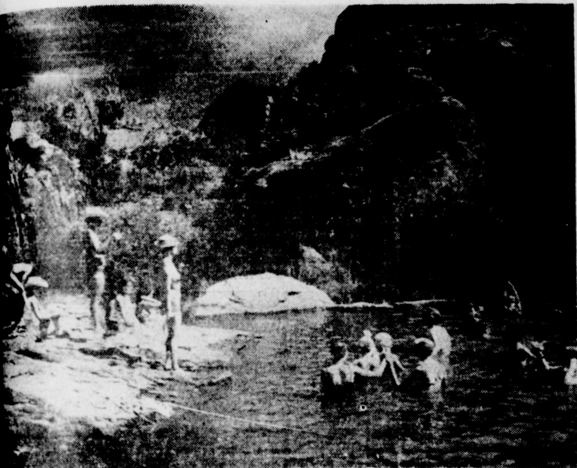
RE PEAK, which gives its name to the Girl Scout Camp for the Permian Basin Council, broods in the gackground of this mountain canyon swimming pool for at the camp.