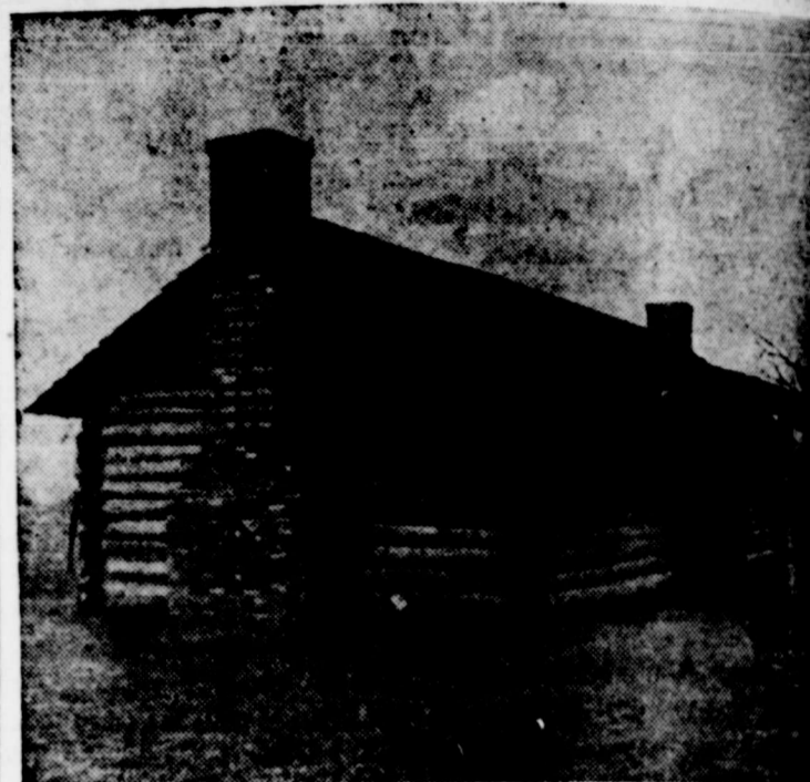
STEPHEN F. AUSTIN STATE PARK has many reminders "Father of Texas," including this pictured replica of his home, San Felipe. The original was on the bank of Bollinger's Creek, flows through the park. To reach the park turn off U. S. Highway 90 three miles east of Sealy and take a paved spur road crosses the Katy railroad tracks.

Club books have been printed and will be distributed giving each member a full understanding of the work schedule.