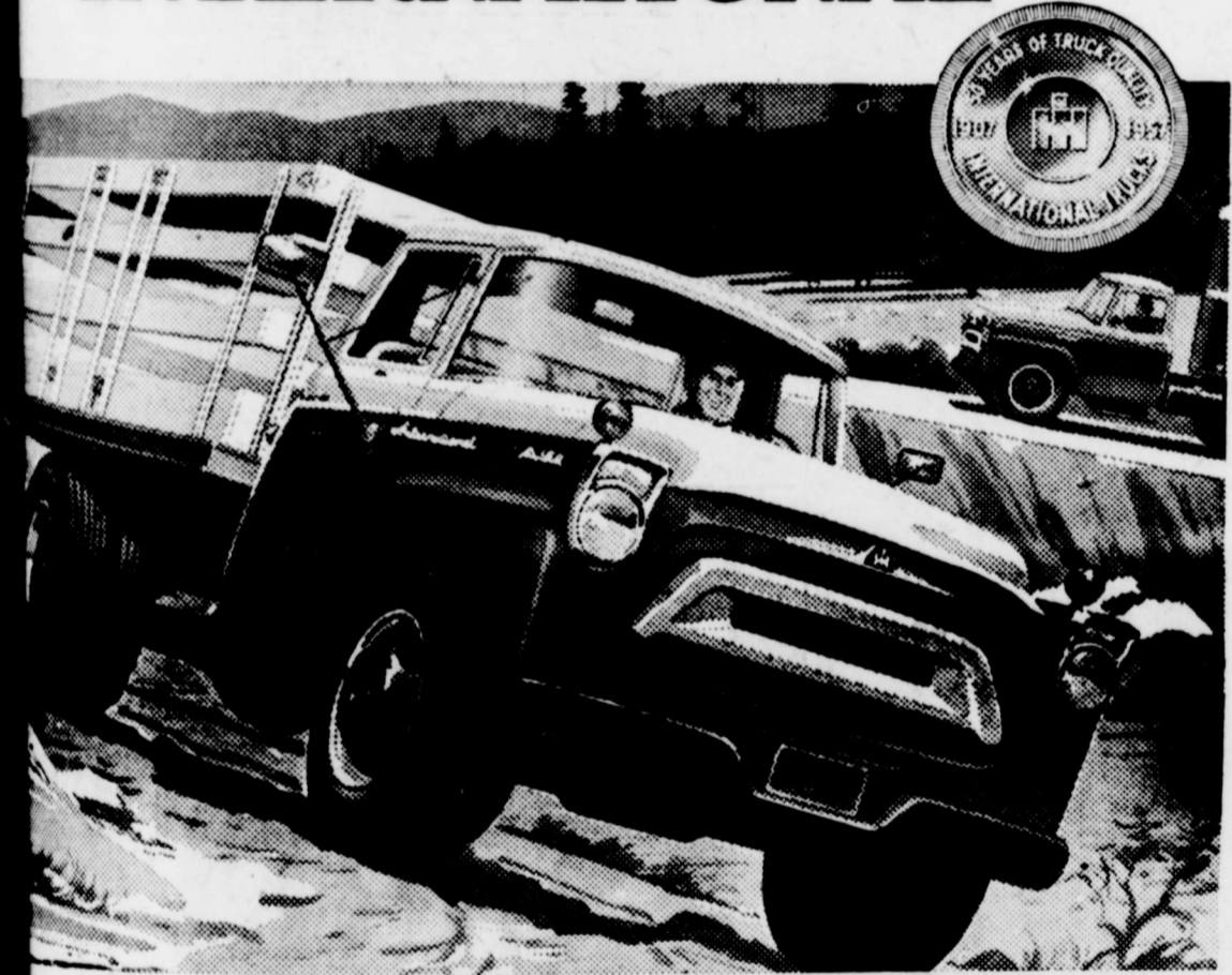
New Golden Anniversary INTERNATIONALS range from Pickups to 33,000 lbs. GVW six-wheelers. Other INTERNATIONALS, to 96,000 lbs. GVW, round out world's most complete line.

Your very first drive in a new Golden Anniversary INTERNATIONAL Truck will sell you on its superior comfort, handling ease and "get up and go."